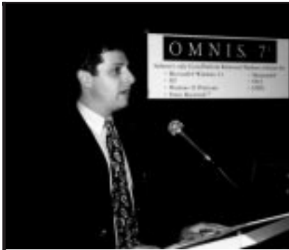
OMNIS World '96